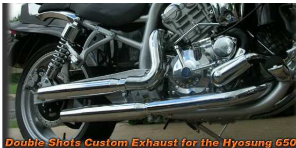
Double Shots Custom Exhaust for the Hyosung 650

For you guys that have a GV650 or want to get a GV650, we now have 3 exhaust options for you. The first is the stock muffler with some internal modifications that greatly increase the deep, low rumble. The price is $149 with exchange of your stock muffler. The second option, is a complete replacement of the pipes and mufflers. It is a great system, custom made and high quality. It is much louder than the stock exhaust. The model is "Double Shot" and it is available as a slashed end pipe or as a straight cut for $455. There is also a version for $525 with internal packing to quiet it down a little bit. The last option is a kit from Fith Gear Customs that sells for $499.